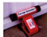
garage door defender