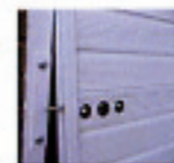
garage locking bolts